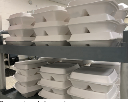
To-go meals ready for members.

Even with the challenges of the pandemic, we served 114,670 meals in 2020, or approximately 313 per day. "With packaging things to go, there are extra steps," says Michael. "But we have a process and we just have to stay organized. My job is to serve a meal that is nutritious, protein-packed, tasty, and good looking, and our members tell us that they appreciate it."