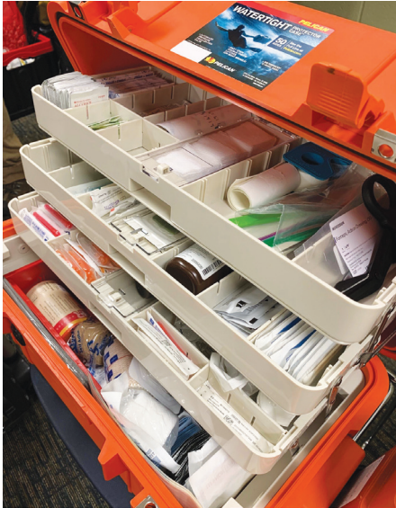
One of Street Medicine Kalamazoo's tackle boxes filled with neatly organized medical supplies.

that the doctors are also seeing individuals that didn't get their name on the list. They try to help everyone they can when they're here."