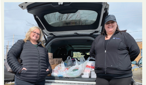
Our friends at West Wind Dental gathered items from our wish list, including a generous amount of toothpaste!