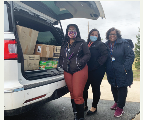
Our amazing neighbors at Biomat USA-Kalamazoo donated masks, hand sanitizer, gloves, and band aids!