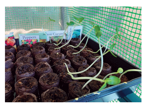
The cucumber seeds were some of the first to sprout!

Keep an eye on our social media for photos and updates!