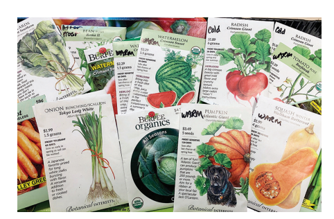
Packets of seeds we plan to grow this year.