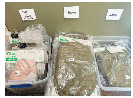
Pet coats organized into storage bins by size.

Thanks to a special grant from the Kalamazoo Community Foundation and the help of our friends at Bark's 5th Avenue, we were able to purchase collars, leashes, and coats so our members could keep their pets safe and warm over the winter!