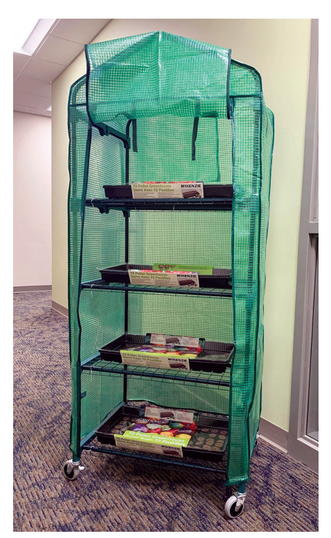
Our mini greenhouse on wheels. Each tray conatains pods of soil to plant seeds in. The wheels allow us to easily move the greenhouse to the sunniest spots in our facility during the day.