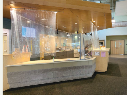
A view of our Service Desk, surrounded in a plastic barrier.