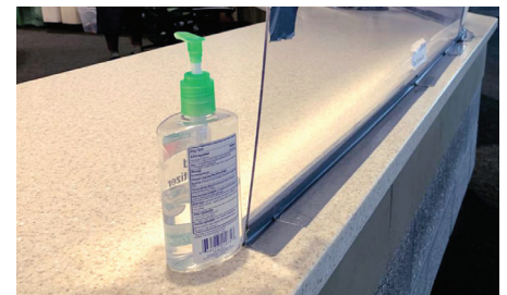
Hand sanitizer is available throughout the building for members and staff.

Kelly notes that, “During busier times of the day, we’re seeing members come in to do what they need to do and then leave so we can let someone else in. We’re still busy, it’s just a different flow.”