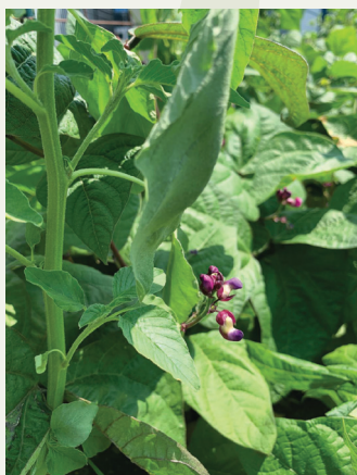
Bean plants blossoming