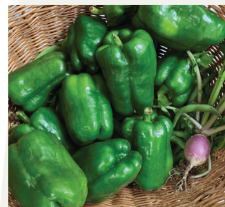
Fresh green peppers and a radish.