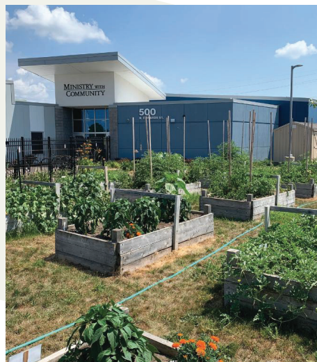
A view of the garden in late June.