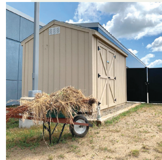
Our new shed is the perfect place to store our gardening tools.

In addition to her Social Work duties, Sarah oversees our garden and organizes planting and harvesting. She also shares her knowledge for all things green with the members and volunteers who provide daily care for our plants. The garden is the one place where we've offered volunteer opportunities during the COVID-19 pandemic. The outdoor space combined with scheduling volunteers and members by individual or household allows for better safety.