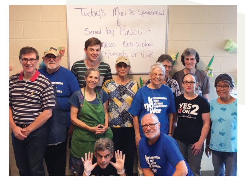
The Kalamazoo Non-Violent Opponents of War sponsored and served a meal on August 17th.