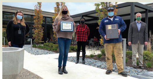
The team at Landscape Forms