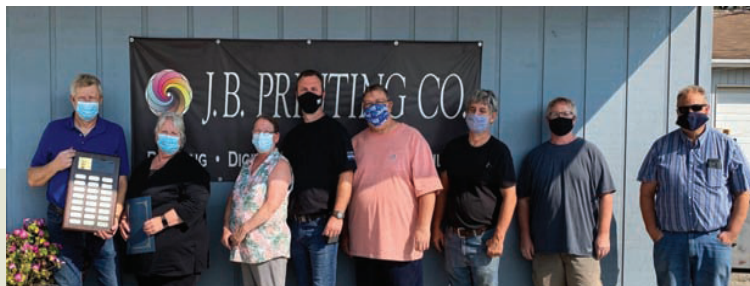
The team at JB Printing