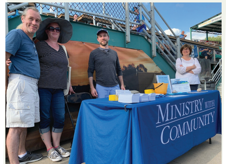
Staff, Board, and volunteers at our info table.