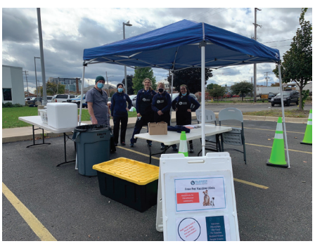
The Humane Society pet clinic was held in our parking lot in October. 16 dogs received care that day.

have an assortment of dog coats to keep everyone safe in the cold months ahead.