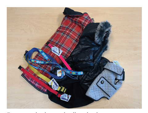
Dog coats, leashes, and collars thanks to a grant from the Kalamazoo Community Foundation and help from Bark's 5th Avenue.